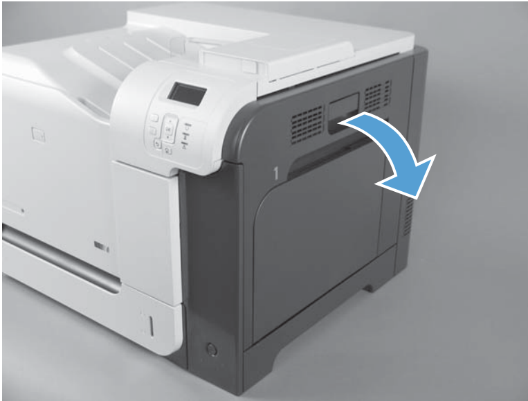
Figure 2-30 Remove the transfer roller (1 of 3)